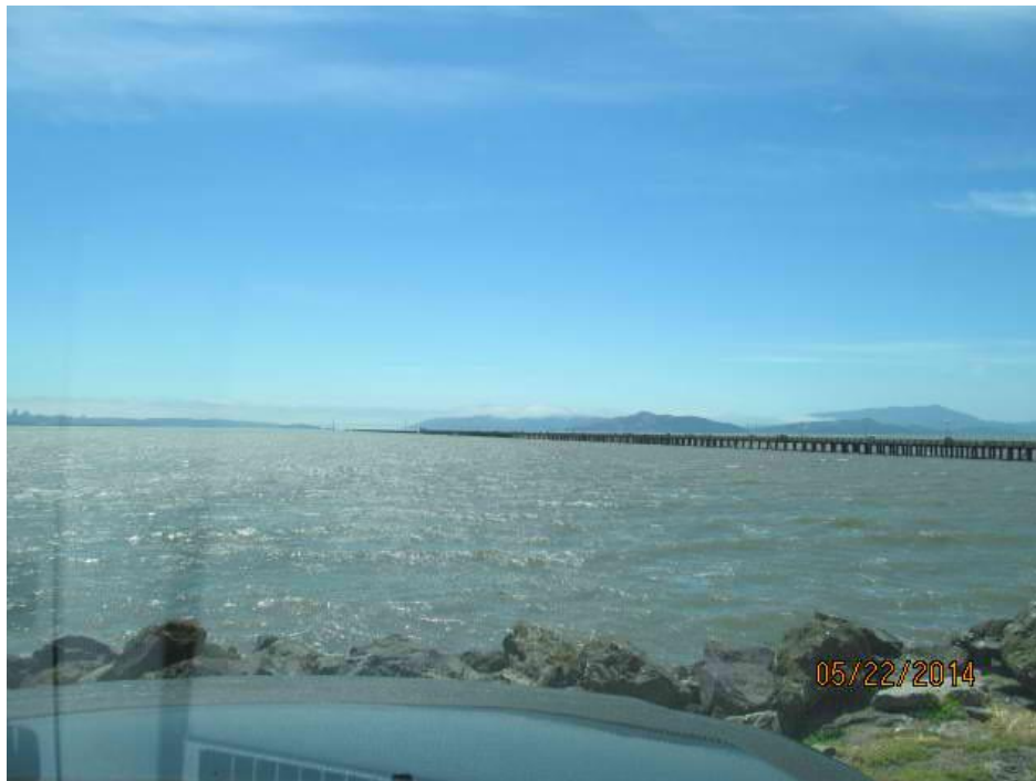
View of the Bay from the Berkeley Marina