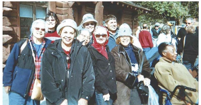
Members enjoy several days and nights in Yosemite, above, and a day trip to the Academy of Sciences, below.