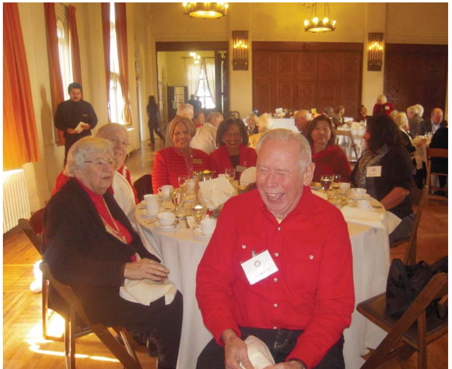
Having fun at the annual UCRAB Holiday Luncheon

Hs Lordships Restaurant 199 Seawall Drive Berkeley Marina 510-843-8144 (Free and convenient parking available)