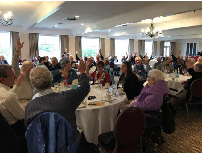
Democracy in Action

Successfully managing induced seismicity is essential for successfully extracting energy while preserving quality of life in areas where energy extraction occurs. The problem is to get policies developed to the same level as the technology has been. To see more details view the full 52 slide presentation on the EX-Ls website. Simply go to retirement.berkeley.edu/ex-ls and click on "Link to Presentations."