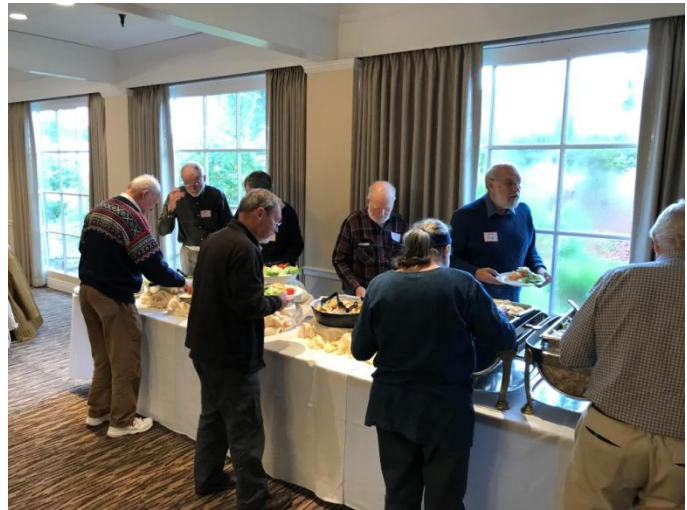
So many choices