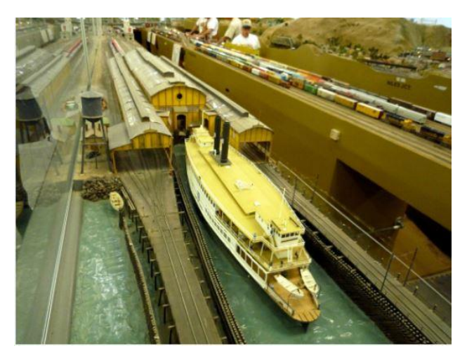
Streetcar Ferry Modeled by Phil Gale

Phil Gale, husband of retiree Phyllis Gale, has belonged to EBME since the early 1960s and models the Key System, an early East Bay streetcar company, at the Museum. It is a HO gage (1:87) layout adjacent to the HO train layout of about 3,800 sq. ft. You can walk and kids can run along the walk way keeping up at with the trains of every gage on 200+ feet of public walkway.