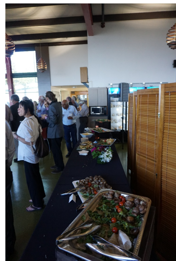
Buffet of tasty food