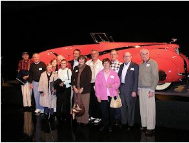
3/12/2009 Visit to Blackhawk Museum