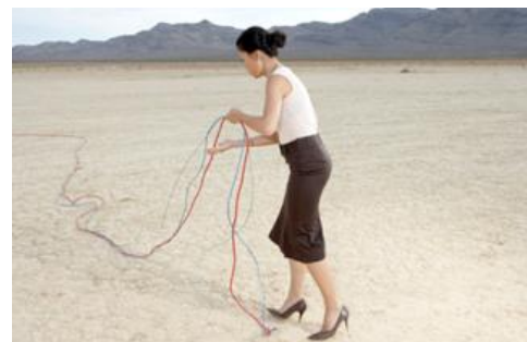
Cords in desert