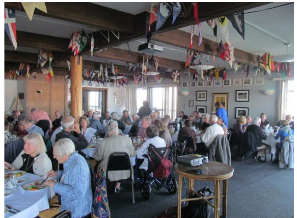
Berkeley Yacht Club – Enjoying tasty food