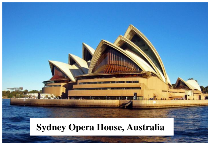
Sydney Opera House, Australia

For reservations and information on Grand Circle Travel call (800)-597-2452, Press 2, and indicate the Booking Number (Grand Circle Group No. G4-23853 for all trips).