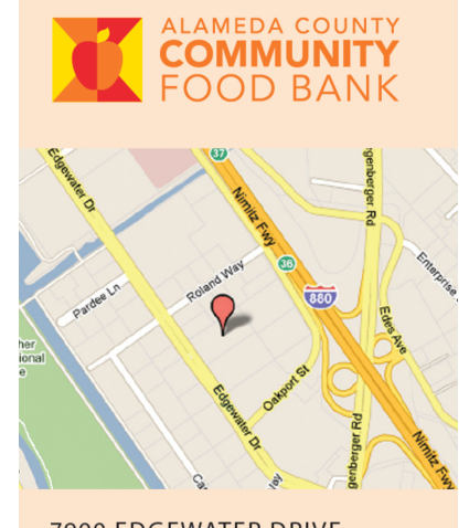
7900 EDGEWATER DRIVE, OAKLAND 94621