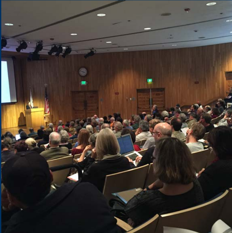
Retirement Planning Seminars