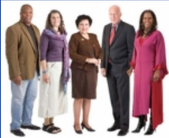
Explore Your Future