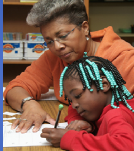
Volunteer and Paid Opportunities